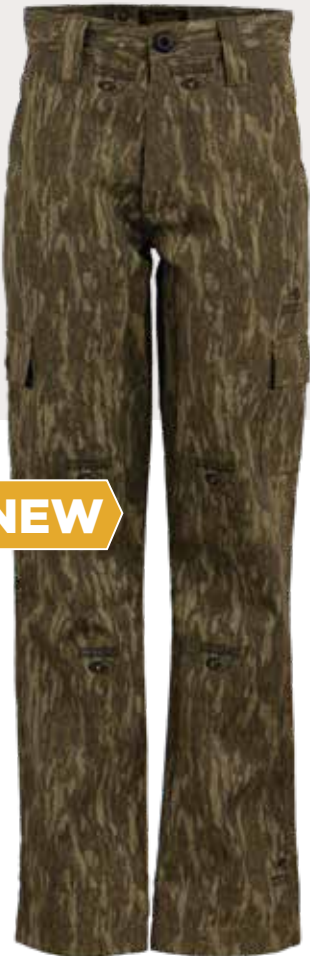
Mossy Oak® New Bottomland™ (NBD)