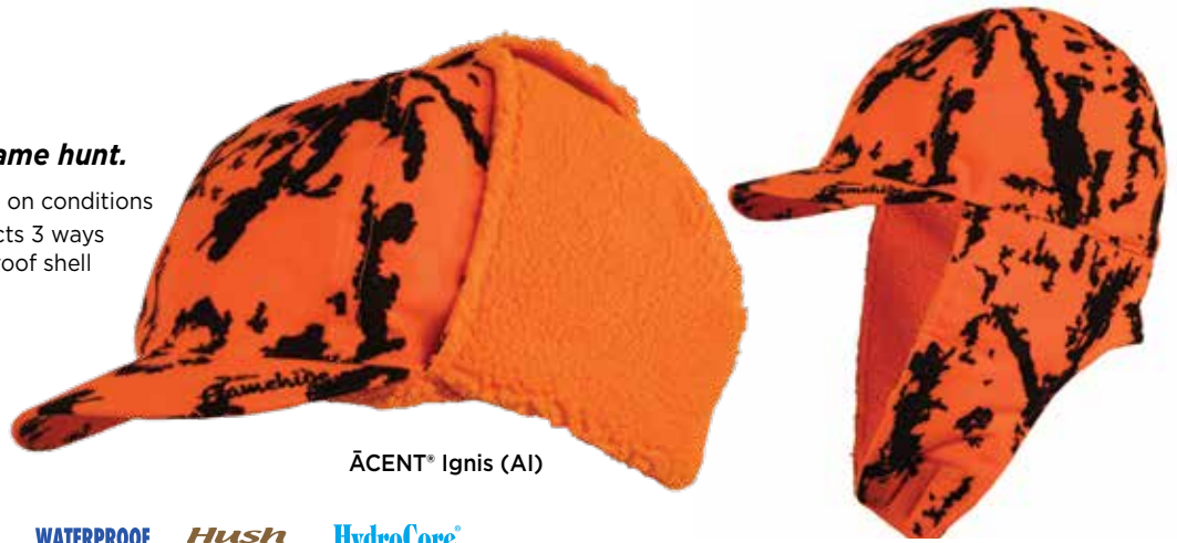
ĀCENT® Ignis (AI)

12 per pre-pack includes; 5/LG and 7/XL in the same color or ordered in quantities of 6 by size in the same color