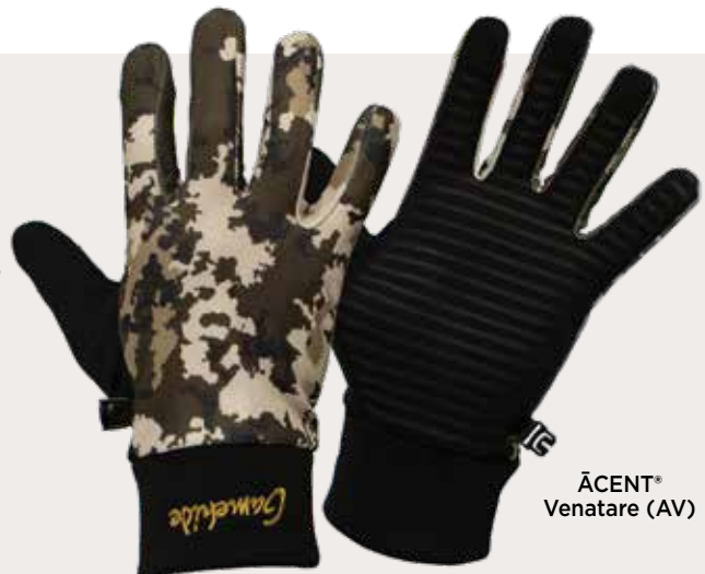
ACENT® Venatare (AV)