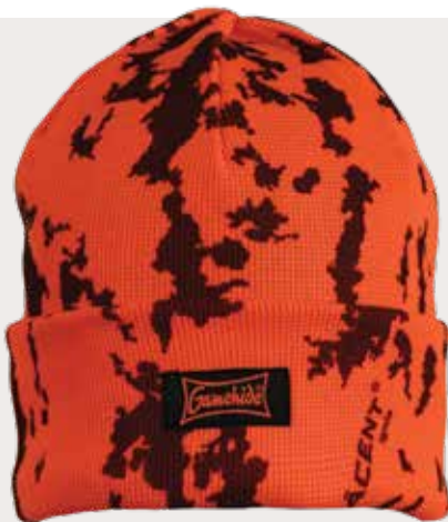
ĀCENT® Ignis (AI)