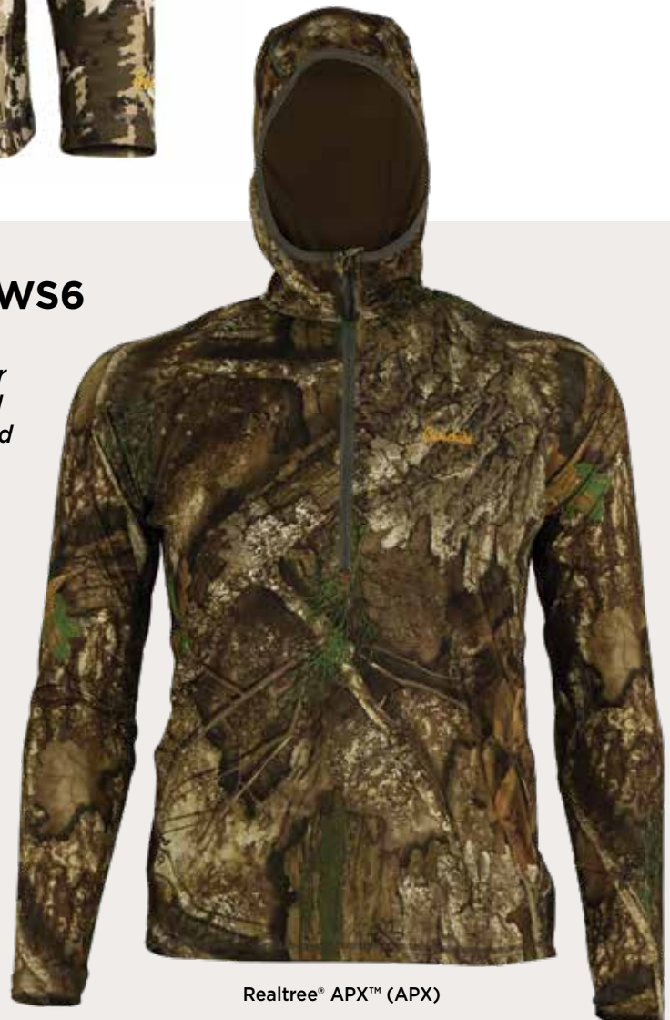
Realtree® APX™ (APX)