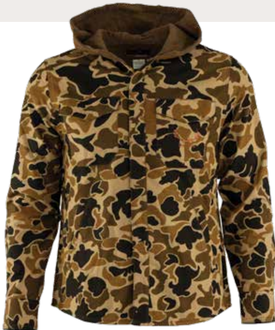
Classic Brown Camo (CBC)