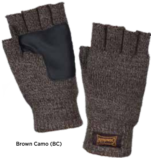
Brown Camo (BC)