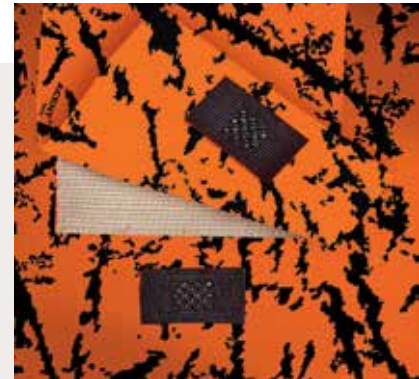
Ultra quiet pocket closure