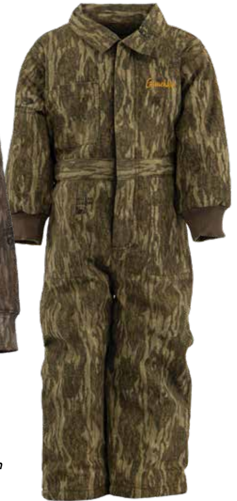
Mossy Oak® New Bottomland™ (NBD)