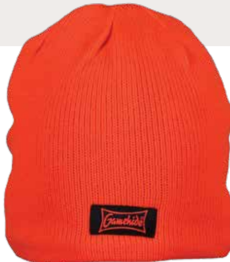
Blaze Orange (OR)