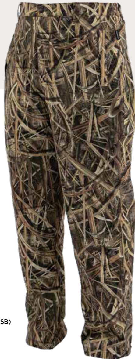
Mossy Oak® Shadow Grass® Blades™ (SB)