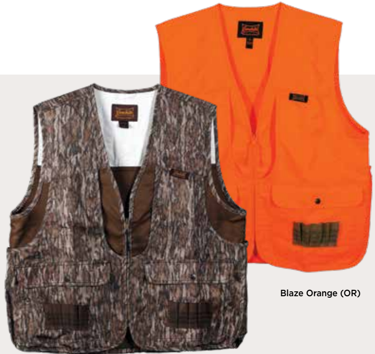
Mossy Oak New Bottomland™ (NBD)