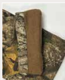
Flannel lined for warmth

Same great features as our Woodsman Jean plus the added warmth of our flannel lining. Perfect for cold weather hunts.