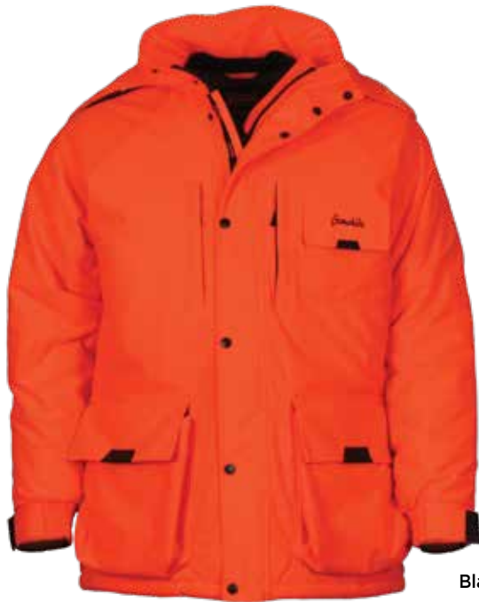
Blaze Orange (OR)