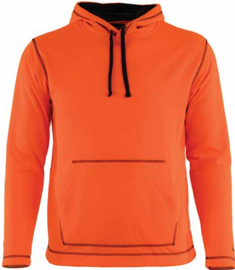
Blaze Orange (OR)