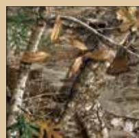
Realtree ® Edge ™ (RE)

See individual garment models for available patterns