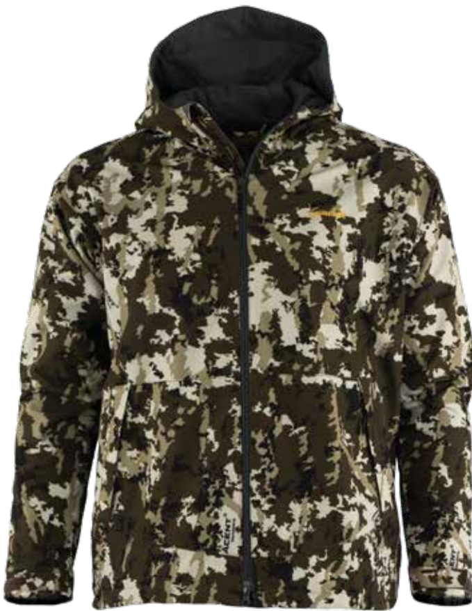
ĂCENT® Venatare (AV)