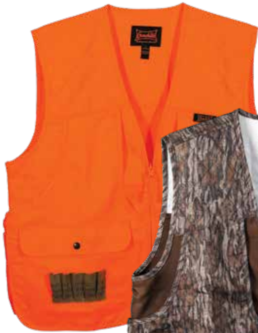
Blaze Orange (OR)