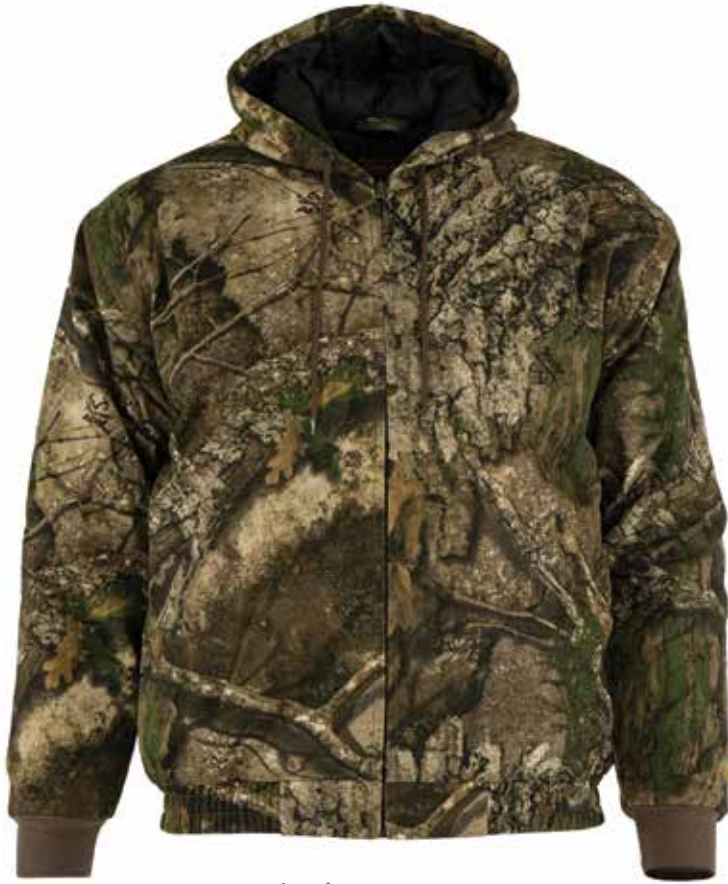
Realtree® APX™ (APX)