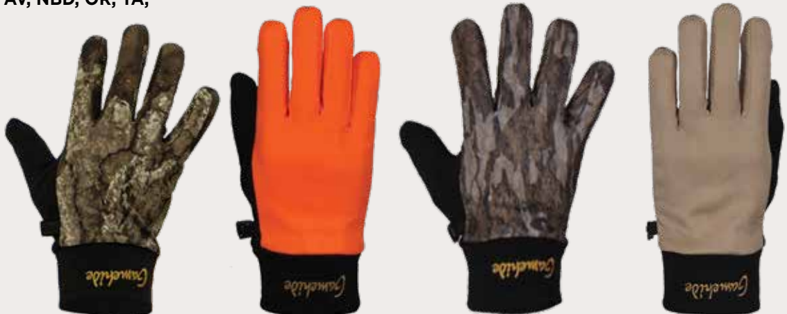
Realtree® APX™ (APX)