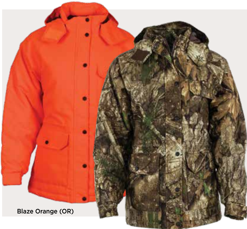
Blaze Orange (OR)