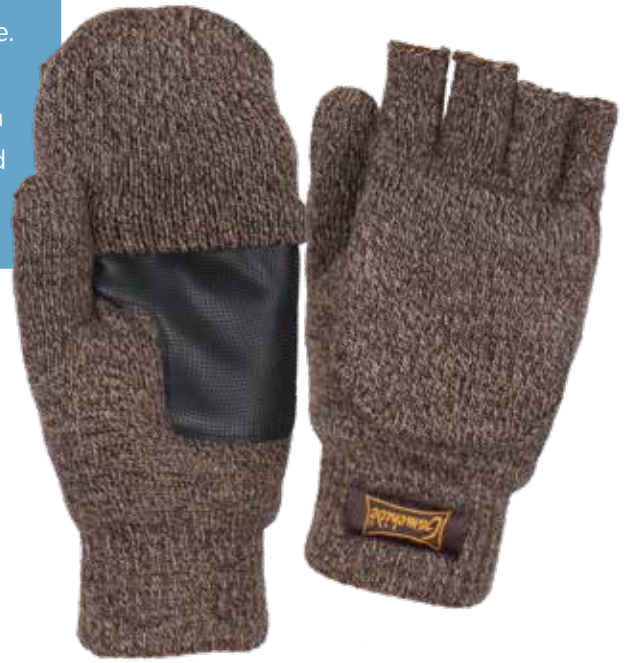
Brown Camo (BC)

Hats or gloves that don't fit are worse than a jacket that's too large. Outfit your young hunter with Youth Accessories from Gamehide® to assure the right fit and a good experience! All Gamehide® Youth Accessories are made with the same high performance fabrics and include the same hunter-friendly features as the adult line.