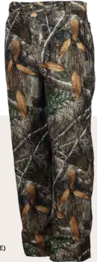
Realtree® Edge™ (RE)