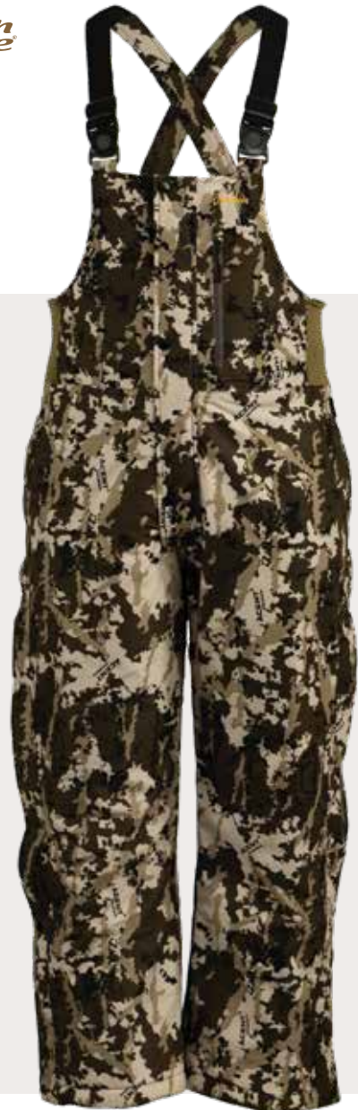
ÄCENT® Venatare (AV)