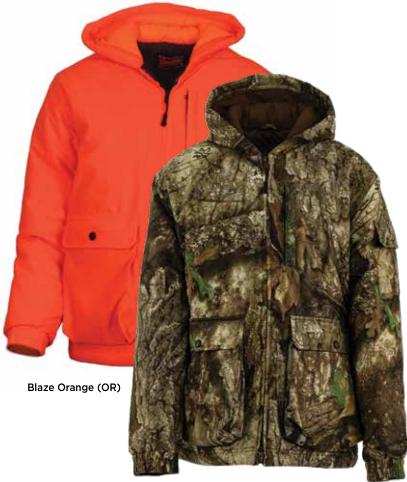
Blaze Orange (OR)