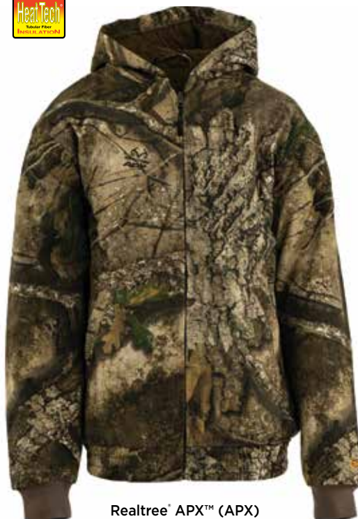
Realtree® APX™ (APX)