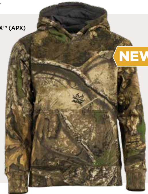
Realtree® APX™ (APX)