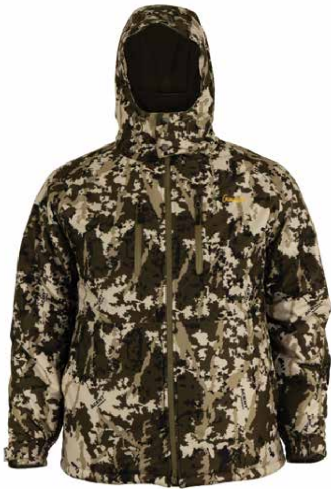
ÄCENT® Venatare (AV)