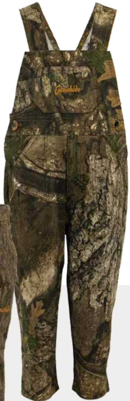
Realtree® APX™ (APX)