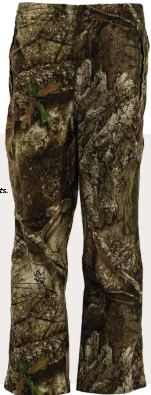
Realtree® APX™ (APX)