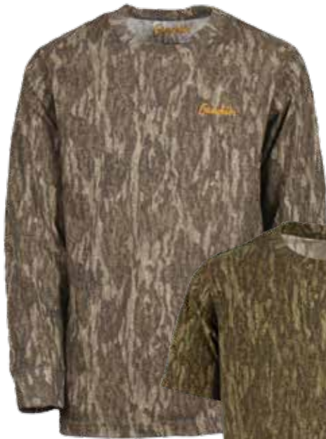
Mossy Oak® New Bottomland™ (NBD)