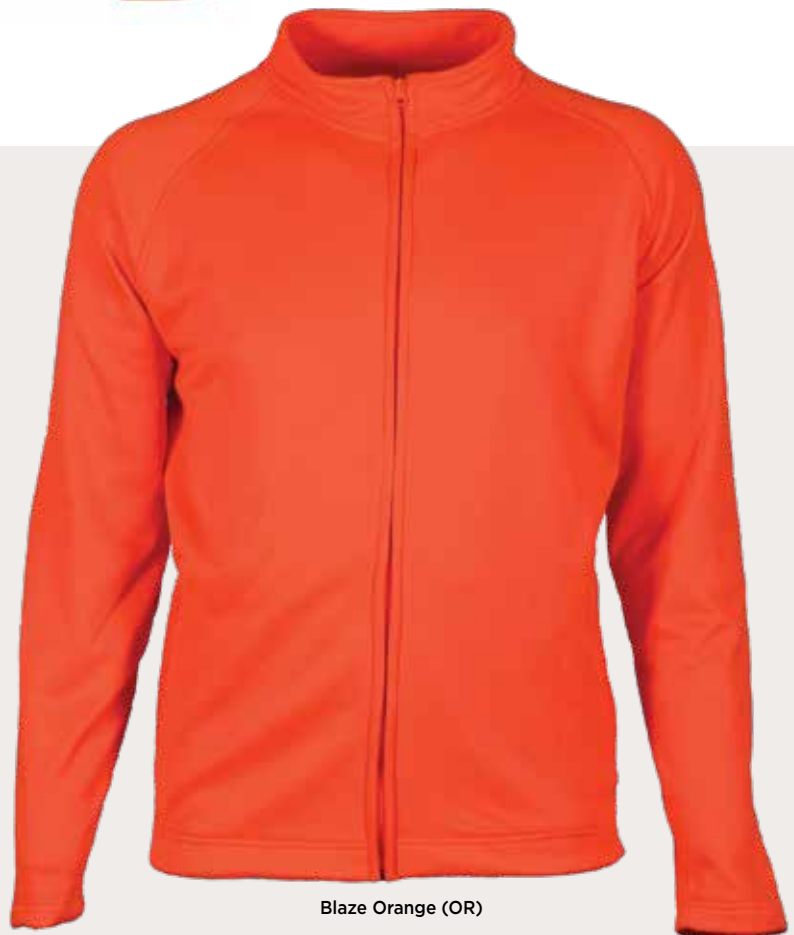
Blaze Orange (OR)