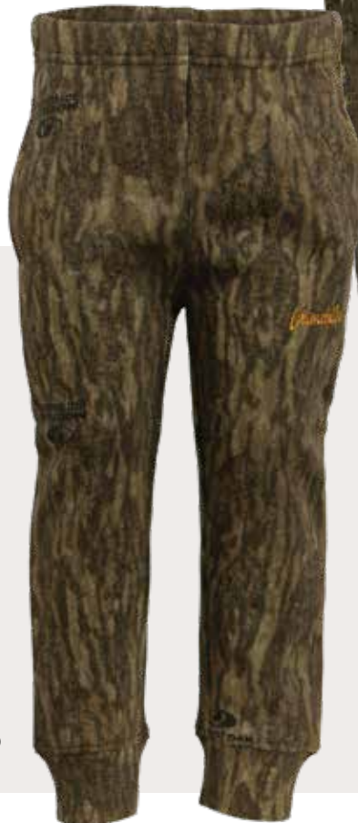
Mossy Oak® New Bottomland™ (NBD)