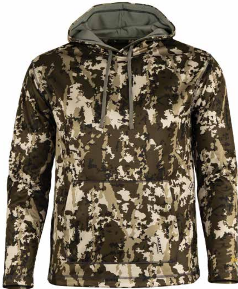
ĀCENT® Venatare (AV)