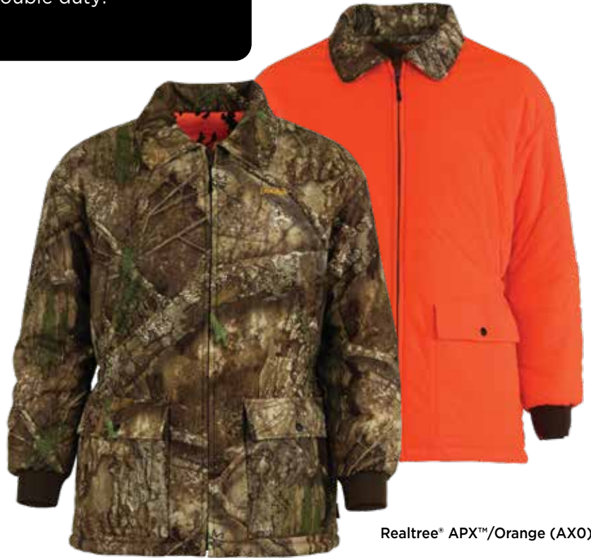
Realtree® APX™/Orange (AX0)