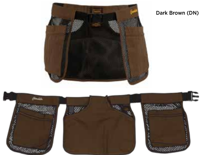
Dark Brown (DN)

One size fits all; 12 per pre-pack of the same color