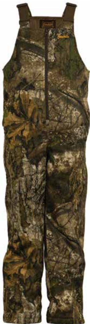
Realtree® APX™ (APX)