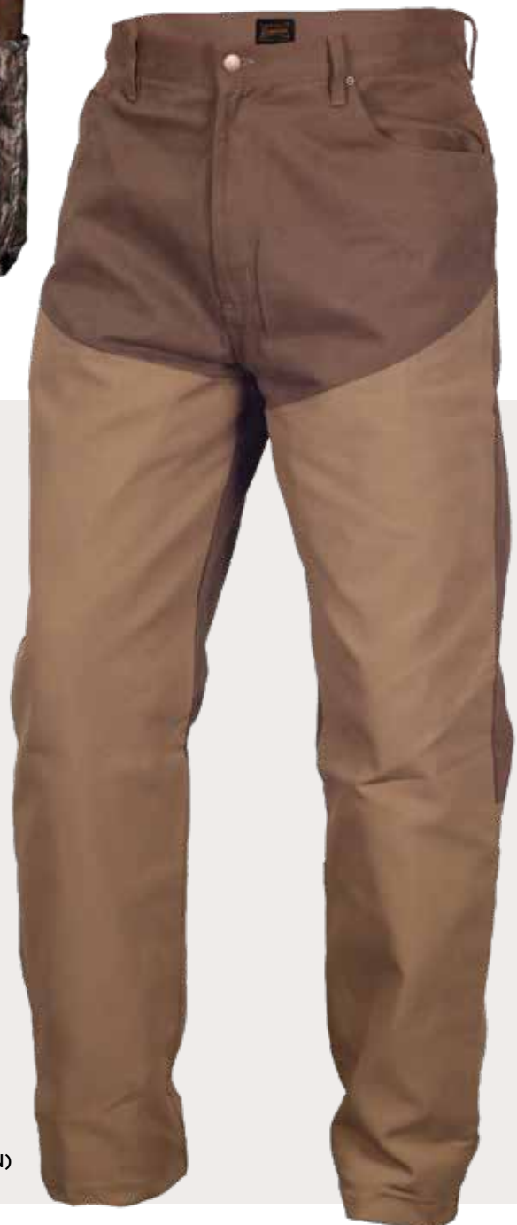
Dark Brown (DN)