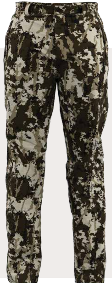
ĂCENT® Venatare (AV)