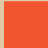
Blaze Orange (OR)