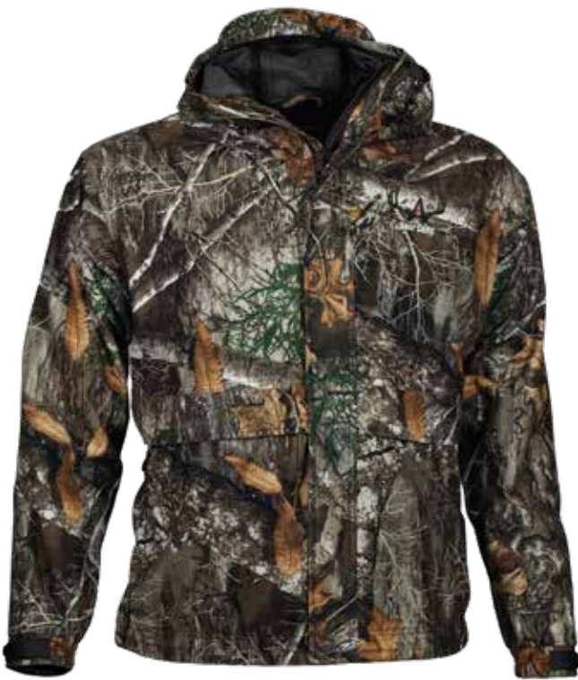
Realtree® Edge™ (RE)