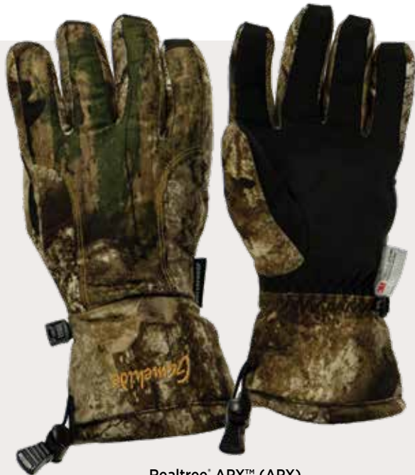
Realtree® APX™ (APX)