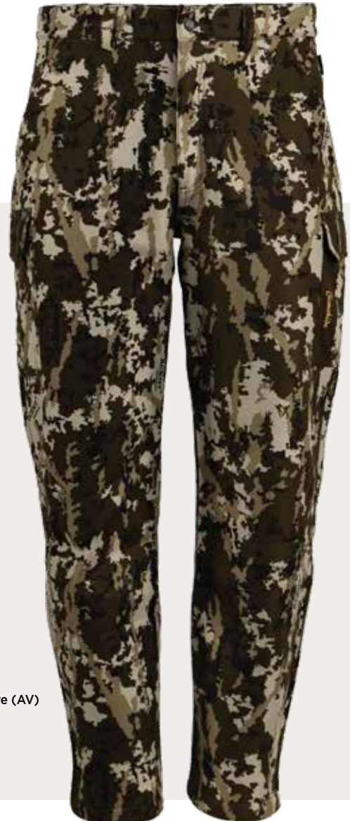
ÄCENT® Venatare (AV)