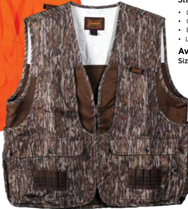
Mossy Oak® New Bottomland™ (NBD)