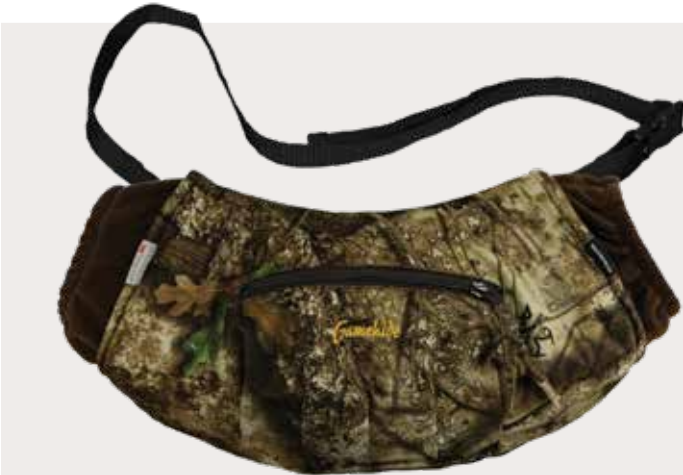
Realtree® APX™ (APX)