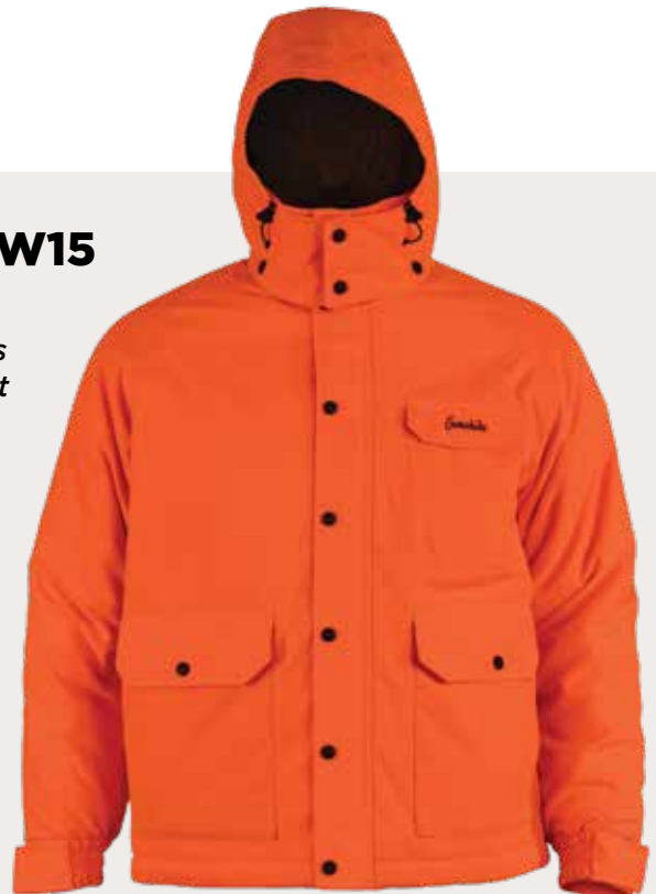
Blaze Orange (OR)