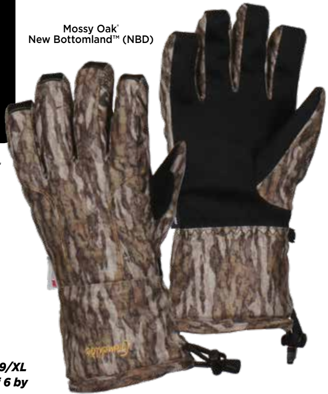
Mossy Oak® New Bottomland™ (NBD)

Pre-Packs of 18 = 3/M; 6/L; 9/XL Or purchase in quantities of 6 by size in the same color