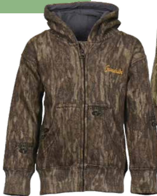
Mossy Oak® New Bottomland™ (NBD)