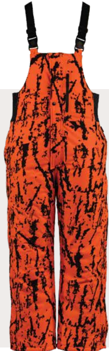
ÄCENT® Ignis (AI)