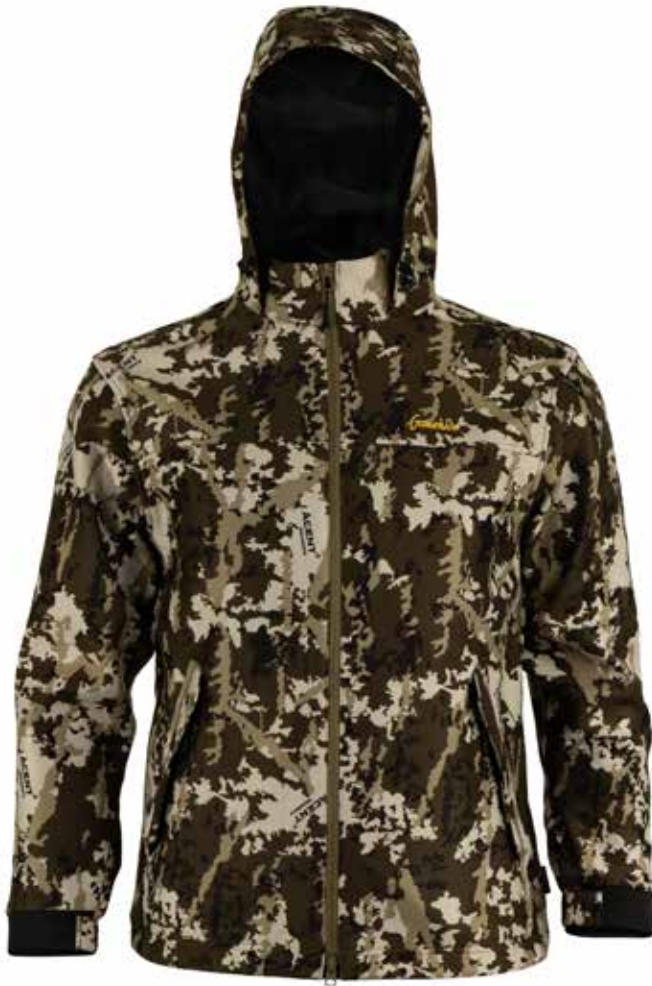
ÄCENT® Venatare (AV)