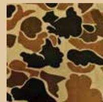
Classic Brown Camo (CBC)