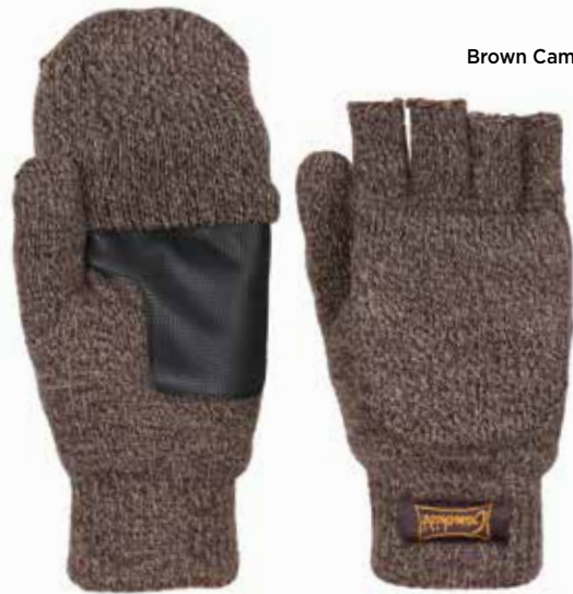
Brown Camo (BC)