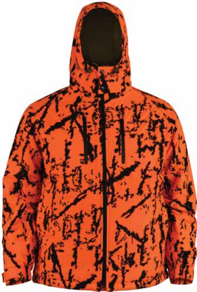
ÄCENT® Ignis (AI)