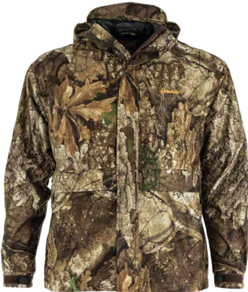
Realtree® APX™ (APX)