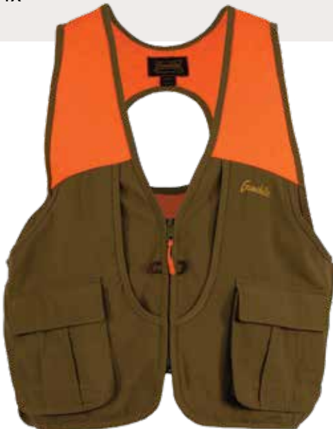
Blaze Orange (OR)