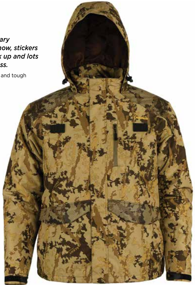
ACENT® Herbosa (AH)