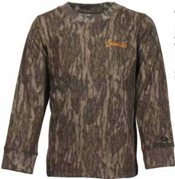
Mossy Oak® New Bottomland™ (NBD)