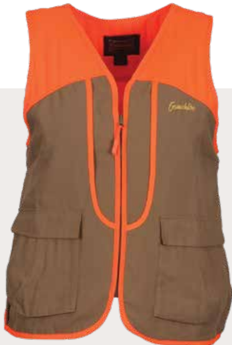
Tan/Blaze Orange (TO)